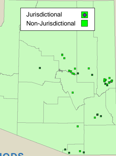
Figure 1: Arizona Game and Fish Department Dams